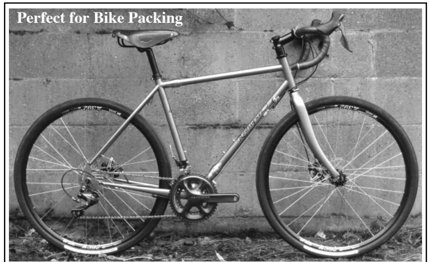
Perfect for Bike Packing