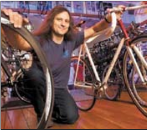
This is me now

In 2006, The Puget Sound Business Journal wrote an article on the store and myself.