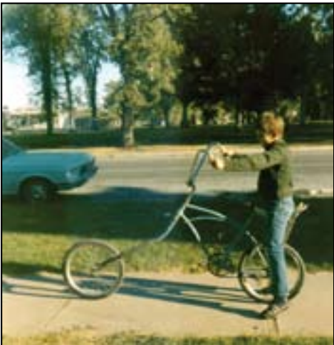
This was me then

Photo courtesy of Dan Schlatter, Puget Sound Business Journal In 2006, The Puget Sound Business Journal wrote an article on the store and myself.