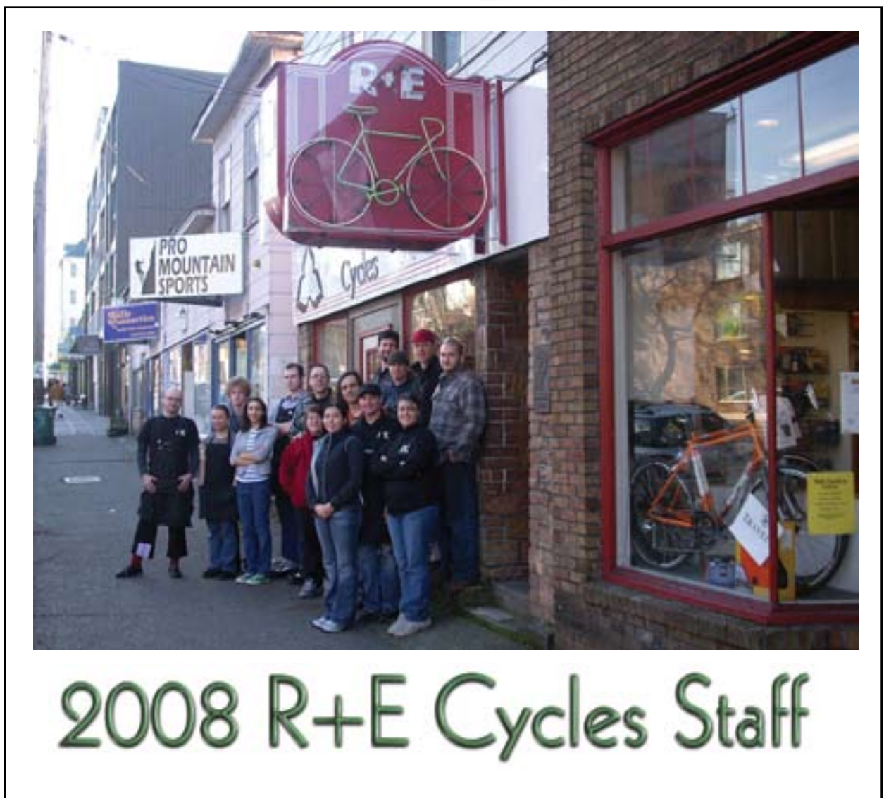
2008 R+E Cycles Staff